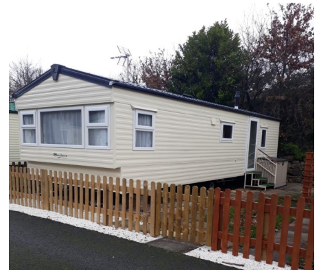
Actual Conwy caravan

The caravan holds up to 4 people based on a double and 1 set of 2 single beds.